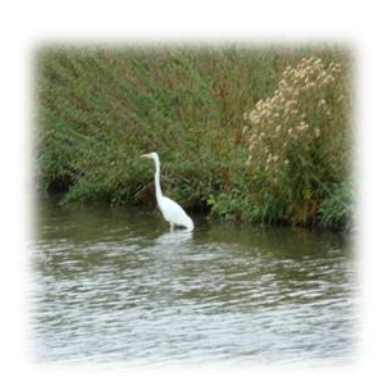
Figure 5 – Westside ID

In Late July, KWUA met with state and federal regulatory agencies regarding the draft Klamath River Basin Total Maximum Daily Load (TMDL). KWUA has sought to take a proactive approach in addressing water quality concerns for interests within the Basin; however, we believe that the water quality standards must be reasonable and attainable. In addition, actions to comply must be affirmatively acknowledged by the agencies and some protections given as a result. Currently there have not been solid suggestions for remedying the (naturally occurring) water quality deficiencies of either the Lost