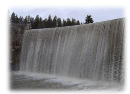
Figure 1 - Gerber Dam

Project irrigators have learned that a once-stable water supply can be disrupted by the Endangered Species Act (ESA). We also know that there are uncertainties associated with the state water rights adjudication, particularly with regard to tribal water right claims. In addition, one cannot look at the issue of water supply without also looking at the state and national political landscape. In an uncertain political climate with respect to water and environmental issues as a whole, KWUA's board has had the