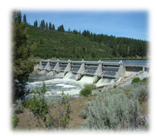
Figure 4 - Keno Dam

All of the Project contractors have fulfilled their contractual obligations to repay a portion of the construction costs of the Project. Yet, as you know, for a number of years there has been a question as to potential additional "debt" of the Project: what it is, how much it is, and how it is supposed to be paid. In any circumstances, we believe there is no legal obligation of the water users to make new payments for "construction" or major capital costs. But at the present, time,