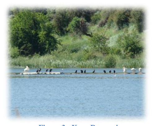
Figure 3 - Keno Reservoir

Other parties in the KBRA negotiation are, of course, interested in increasing fish habitat and the range of various fish species. From the outset, as KWUA was asked to support measures that would introduce or reintroduce species in the Upper Klamath Basin which are not now present, we emphasized that Upper Basin irrigators would require protection from any new regulatory burdens that might come with the fish.