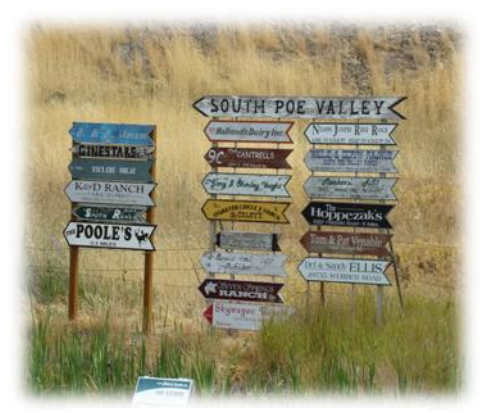
Figure 6 - Directions

It is important to note that the Designated Management Agencies (DMAs) mentioned in this outline, refers to the irrigation and drainage districts of the Klamath Project. According to the state, the DMAs would work in cooperation with Oregon Department of Environmental Quality (ODEQ) to implement the WQMP. There is much debate as to the legality and/or willingness of districts being appointed as DMAs. KWUA intends to advocate strongly on behalf of our member districts as to the need for an overall