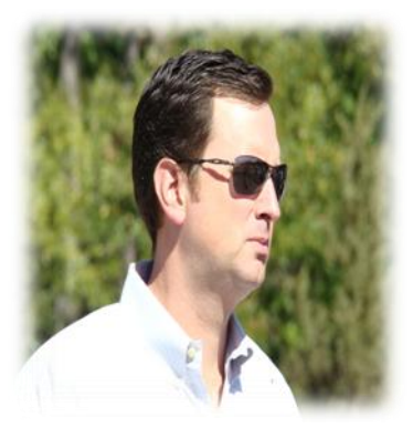
Figure 8 - OR State Senator Jason Atkinson on a Klamath Tour

KWUA is also working on outreach efforts to the campaign and advisory staff for both Presidential candidates.