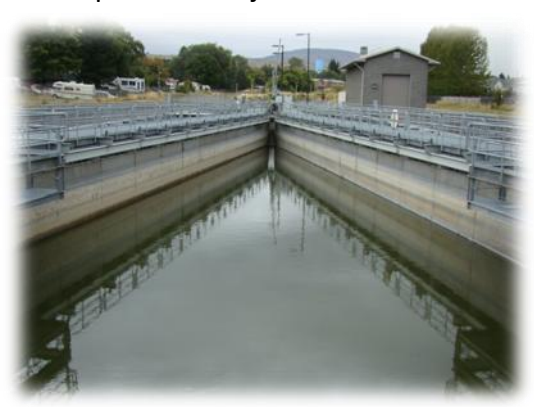
Figure 2 - A Canal Fish Screen

The KBRA sets a goal of achieving a power rate (delivered) of 3 cents per Kilowatt hour. Though some details of how this would be achieved have evolved over the past year, the goal remains the same. We believe that using a combination of federal power allocation along with a fund to invest in and build renewable energy generation will accomplish this objective. As has been the case from day one, this target as worked on