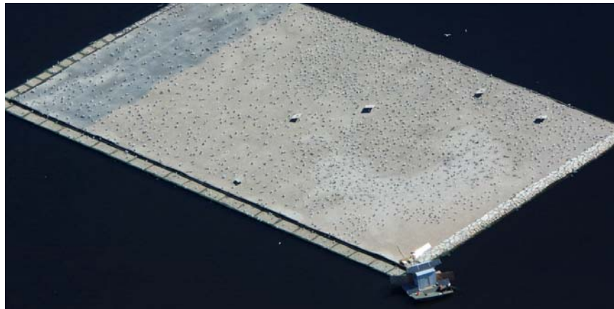
Overhead view of floating island - Sheepy Lake, California