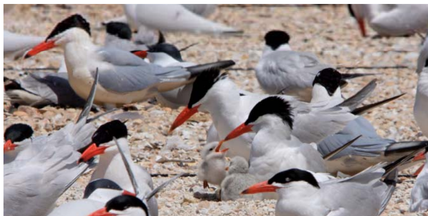
Caspian terns and fledglings - Sheepy Lake, California