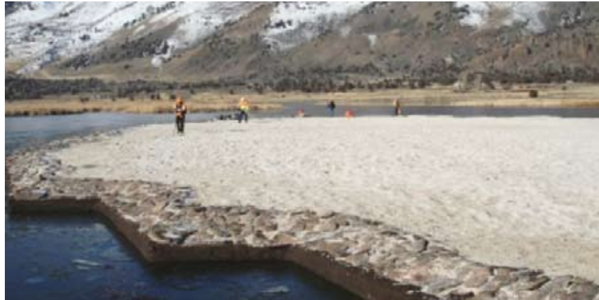
Completing the floating island - Dutchy Lake, Oregon