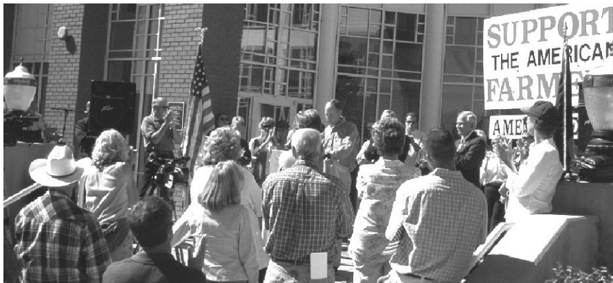
A big crowd in Klamath Falls (Oregon), where Reclamation water supplies were cut off in 2001 because of the Endangered Species Act's administration, attends a rally marking introduction of ESA reform legislation.

He has embraced issues like tax reform, deregulation, energy, private property rights and national defense.