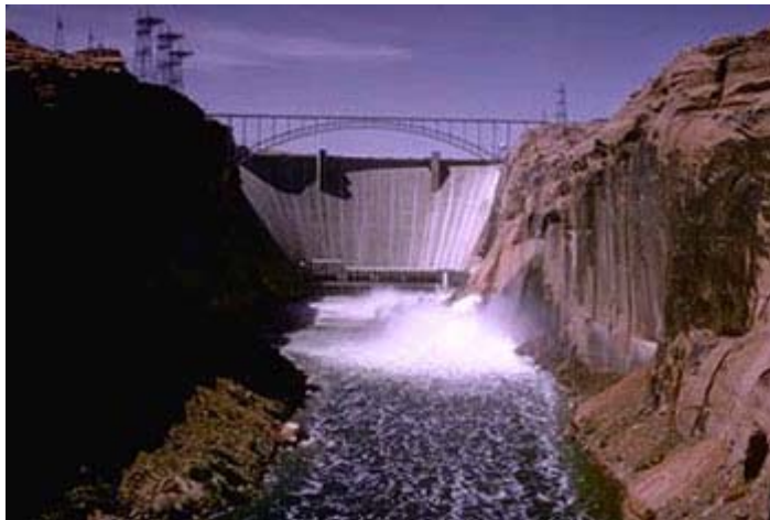
FIGURE 1-1 Reclamation's flagship facilities: (upper left) Grand Coulee Dam, (right) Hoover Dam, (lower left) Glen Canyon Dam.